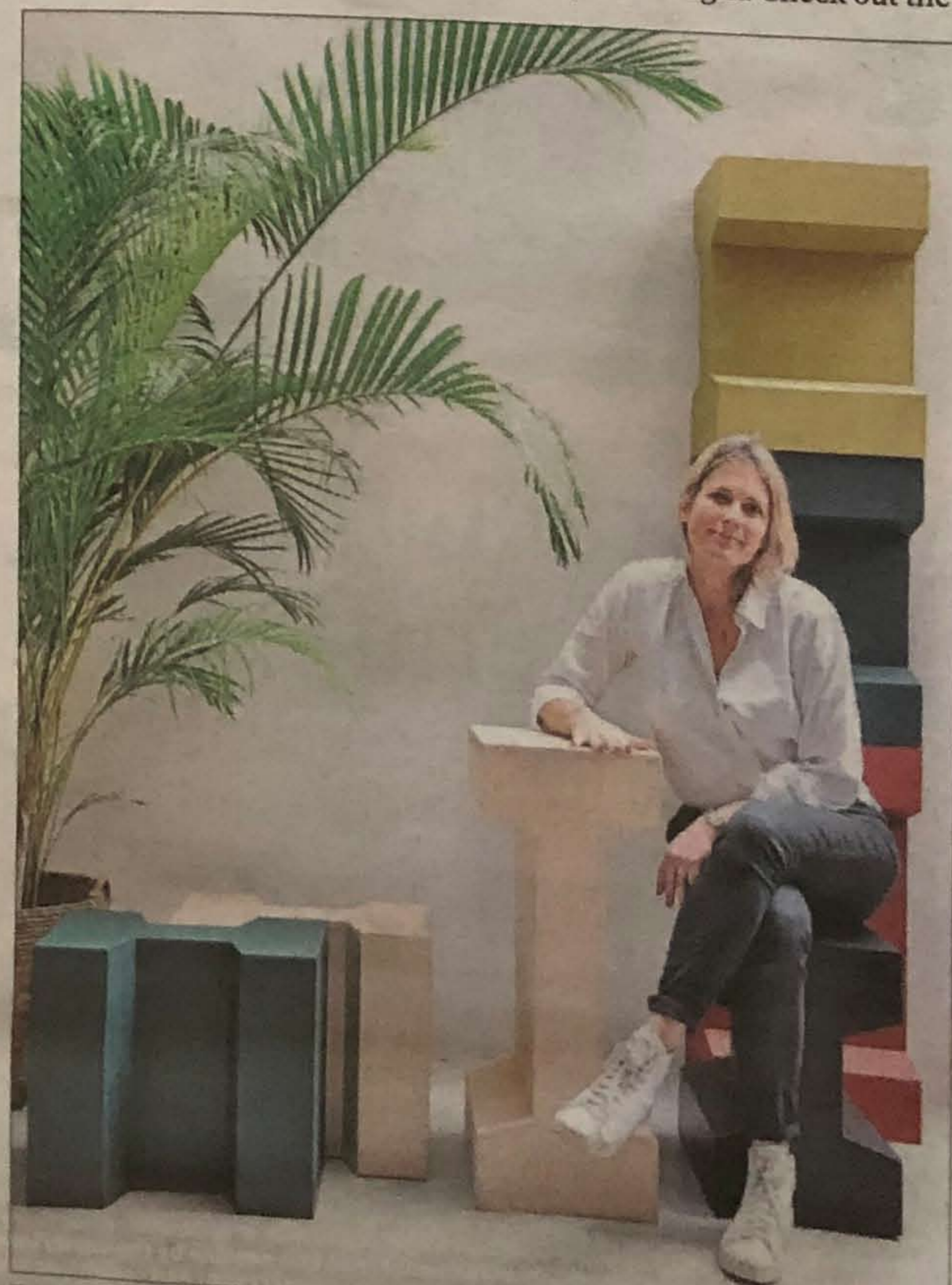
Functional sculpture: Gwendoline Porte Design, showing at Platform

For a FREE brochure or a design visit go to LONDONDOOR.CO.UK or call 0845 646 0690