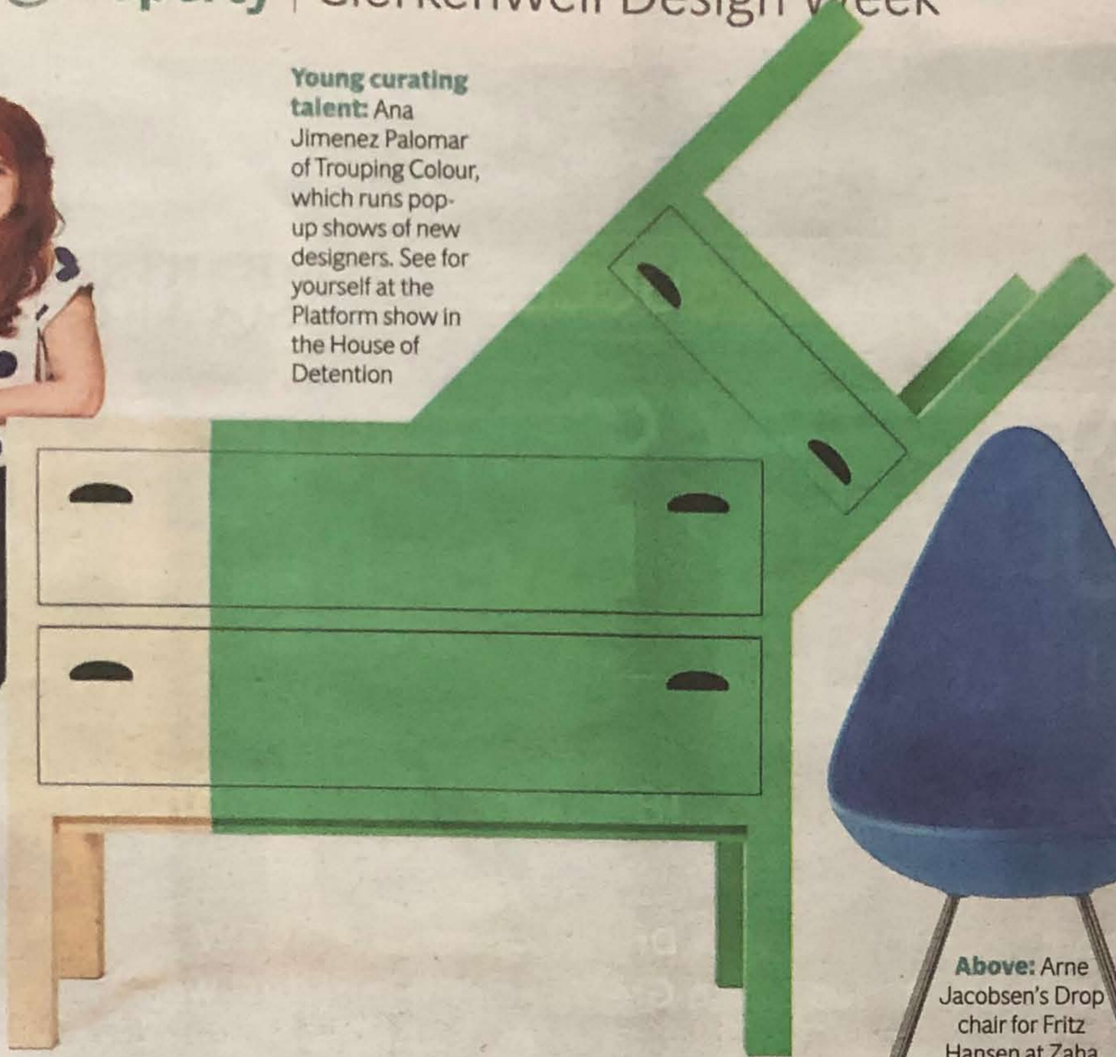
Above: Arne Jacobsen's Drop chair for Fritz Hansen at Zaha Hadid Gallery Below: Bonzo bed by Bauwouhaus. See it at Platform (bauwouhaus.co.uk)